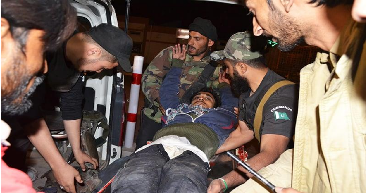
Volunteers and security personnel helping the victims of attack, Dawn, October 25, 2016.