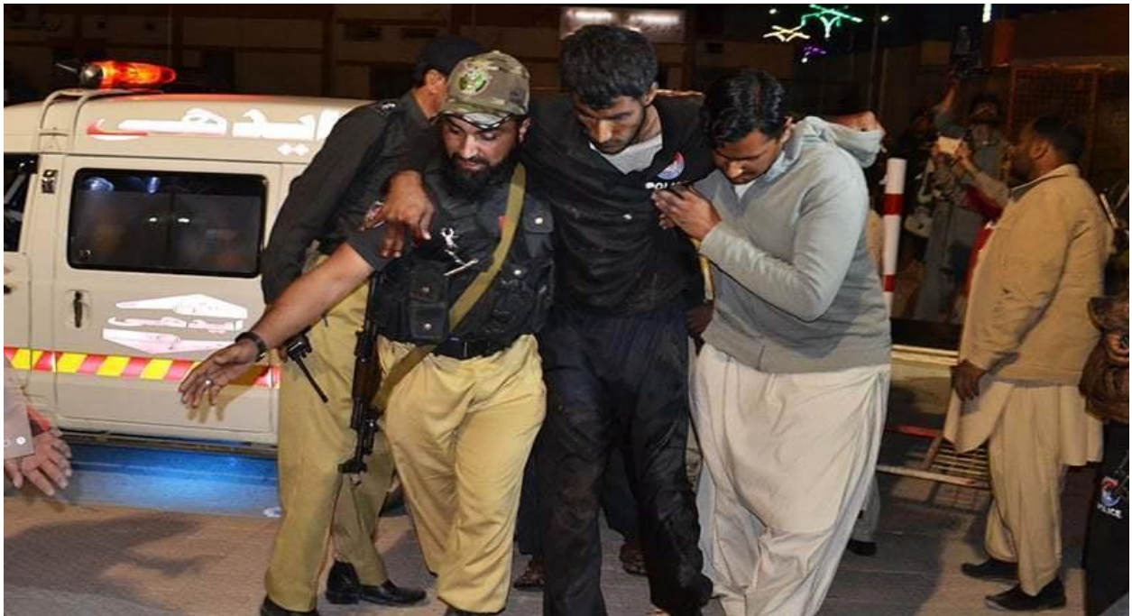
A victim of Police Training College attack is being taken to hospital, Dawn, October 25, 2016.