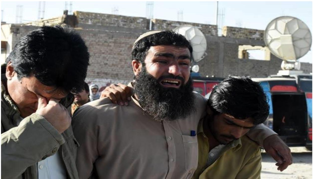
Relatives of Quetta attack victims mourning, The Express Tribune, October 24, 2016.