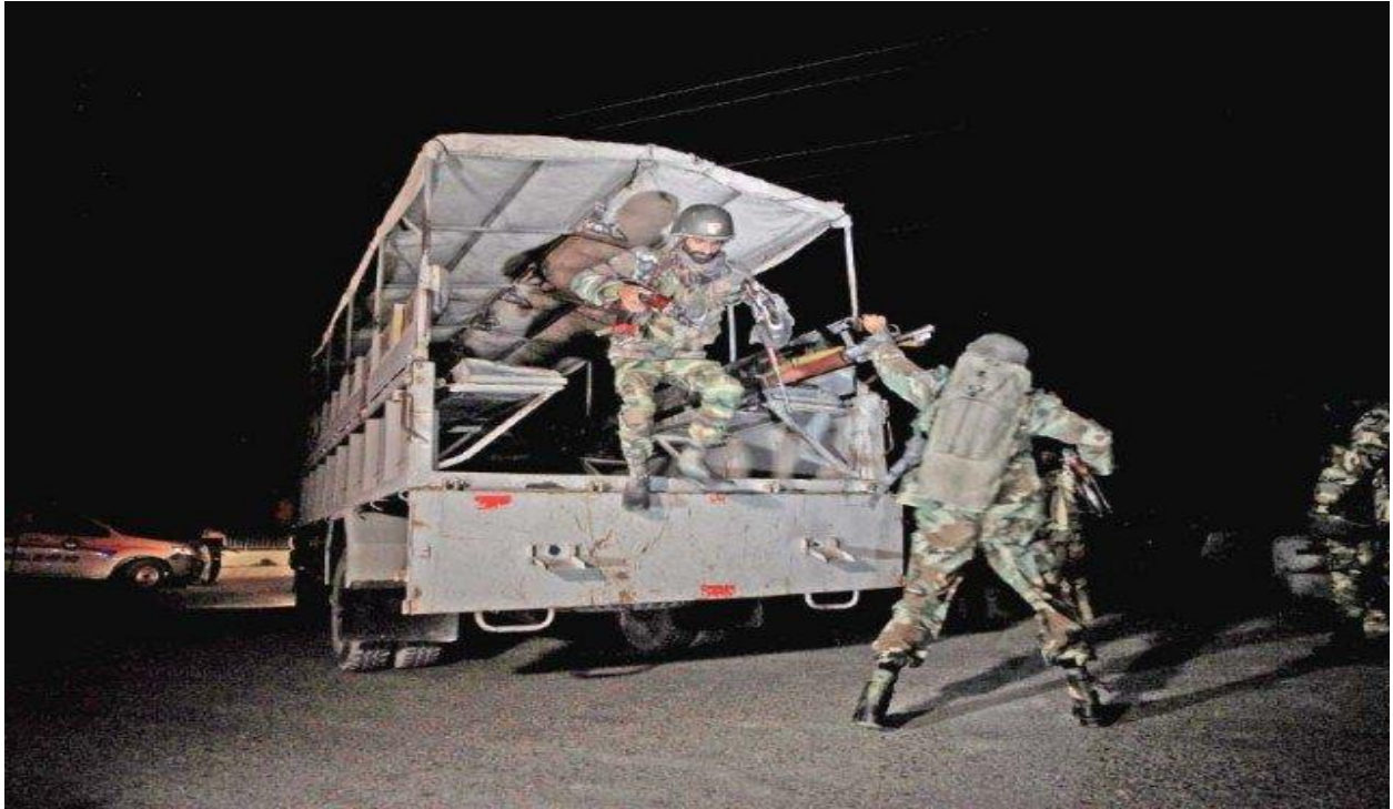
Security personnel rushing to attack scene, The Express Tribune, October 24, 2016.