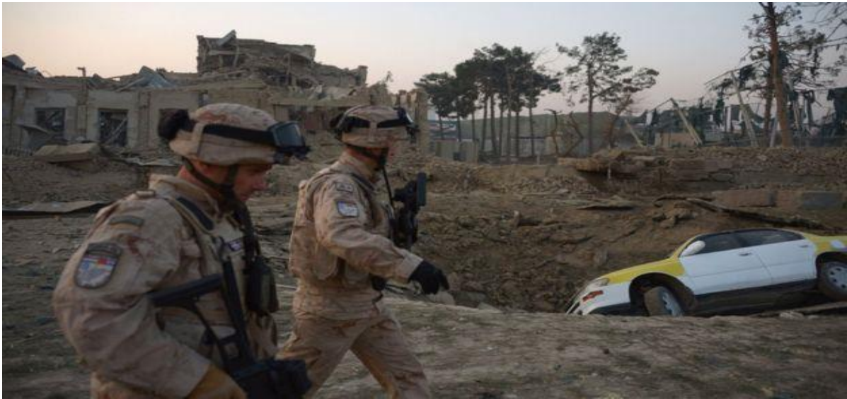
Rescue work near German Consulate in Mazar-e-Sahrif, BBC, 11 November 2016