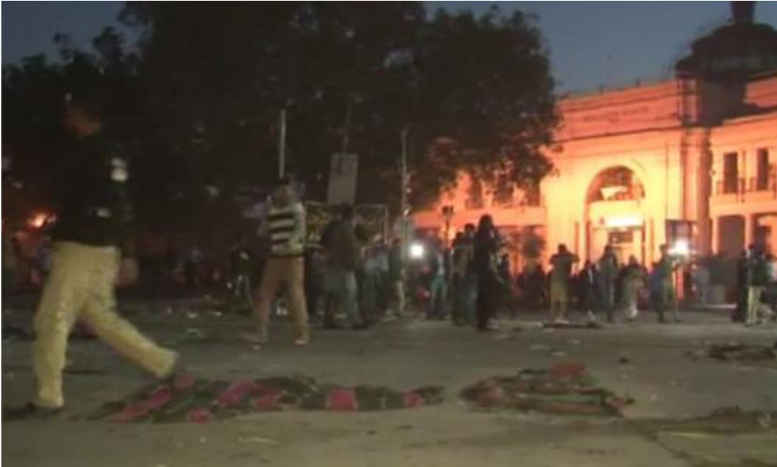
Sight of explosion. Dawn, February 14, 2017.