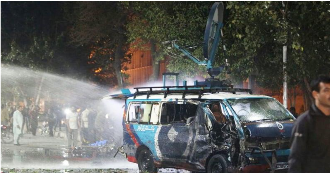
The vehicle of a media channel destroyed in blast. Dawn, February 14, 2017.