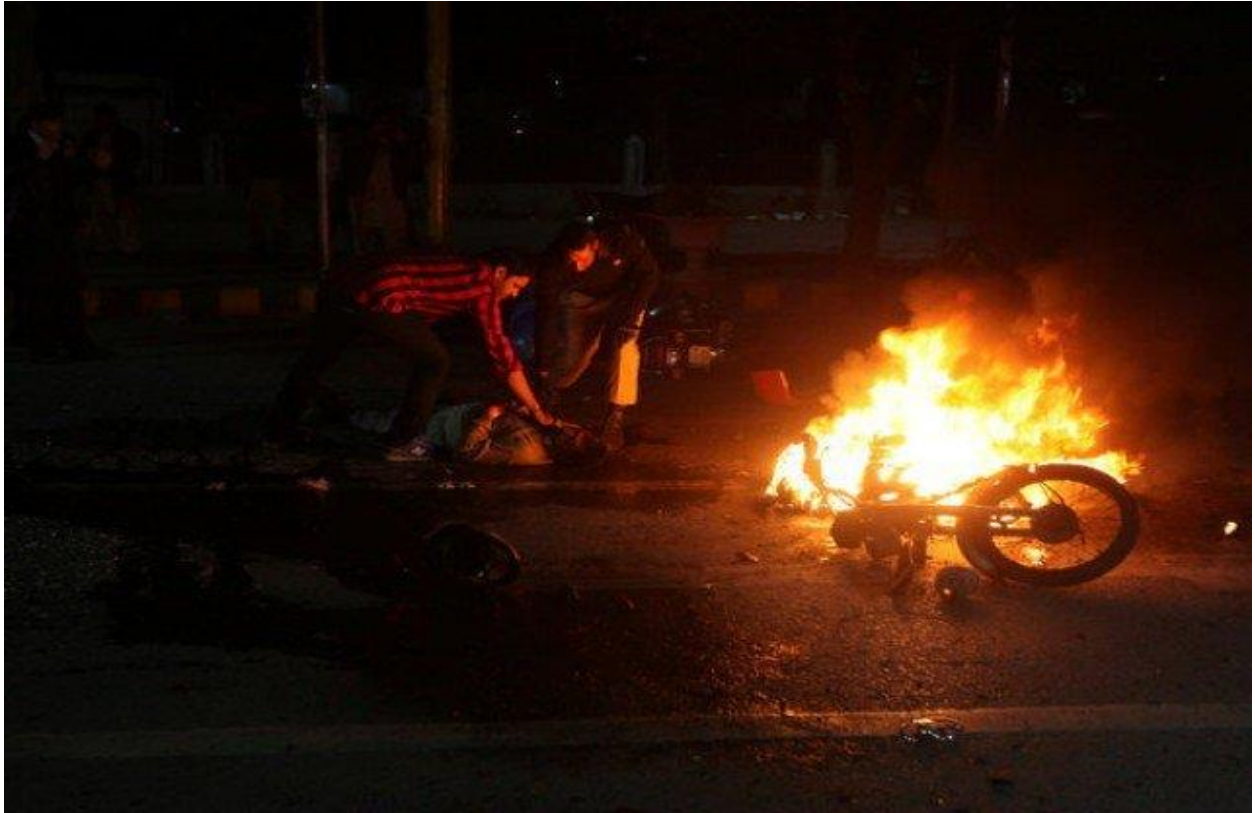
Volunteers helping the victims at blast sight.