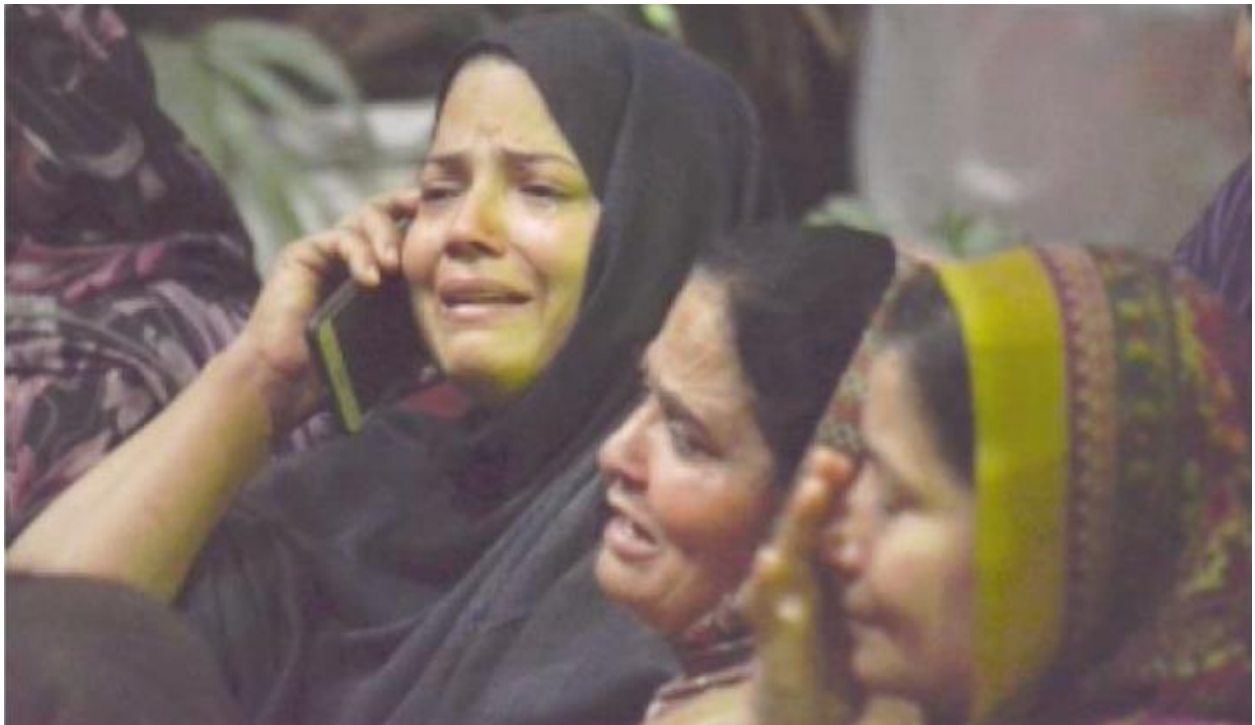
Relatives of victims mourning at the scene. The Express Tribune, February 14, 2017.