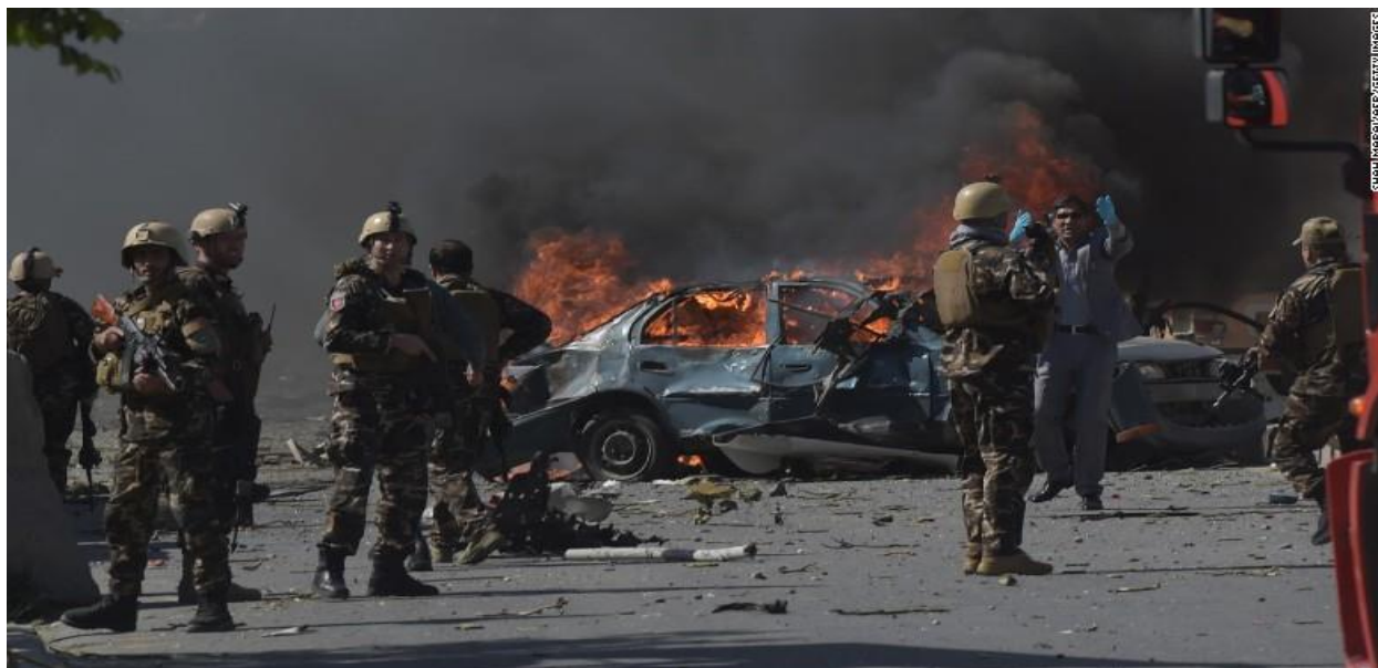
Afghan Security Forces Patrol the Blast Site, CNN, May 31, 2017.