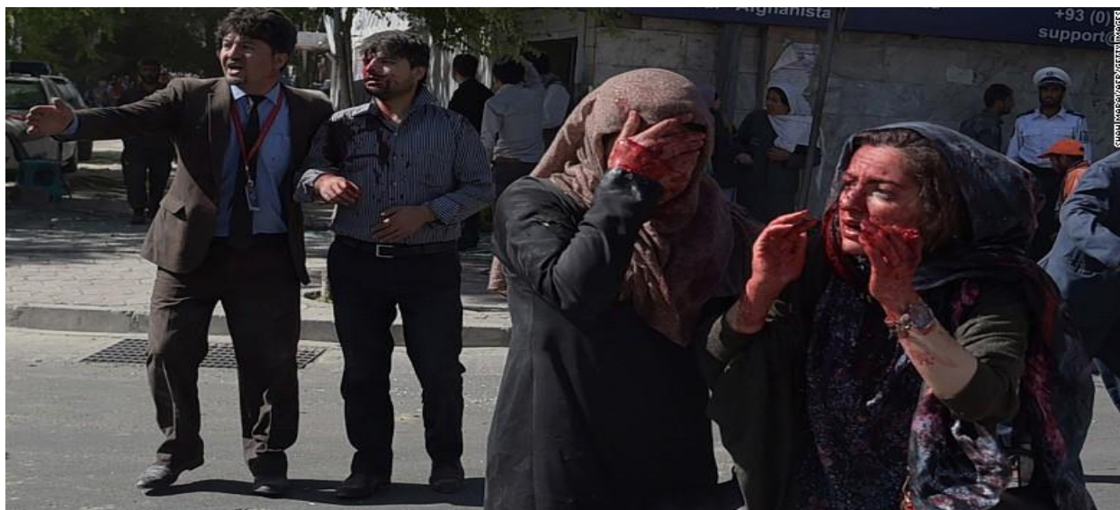
Injured Civilians at Blast Site, CNN, May 31, 2017.