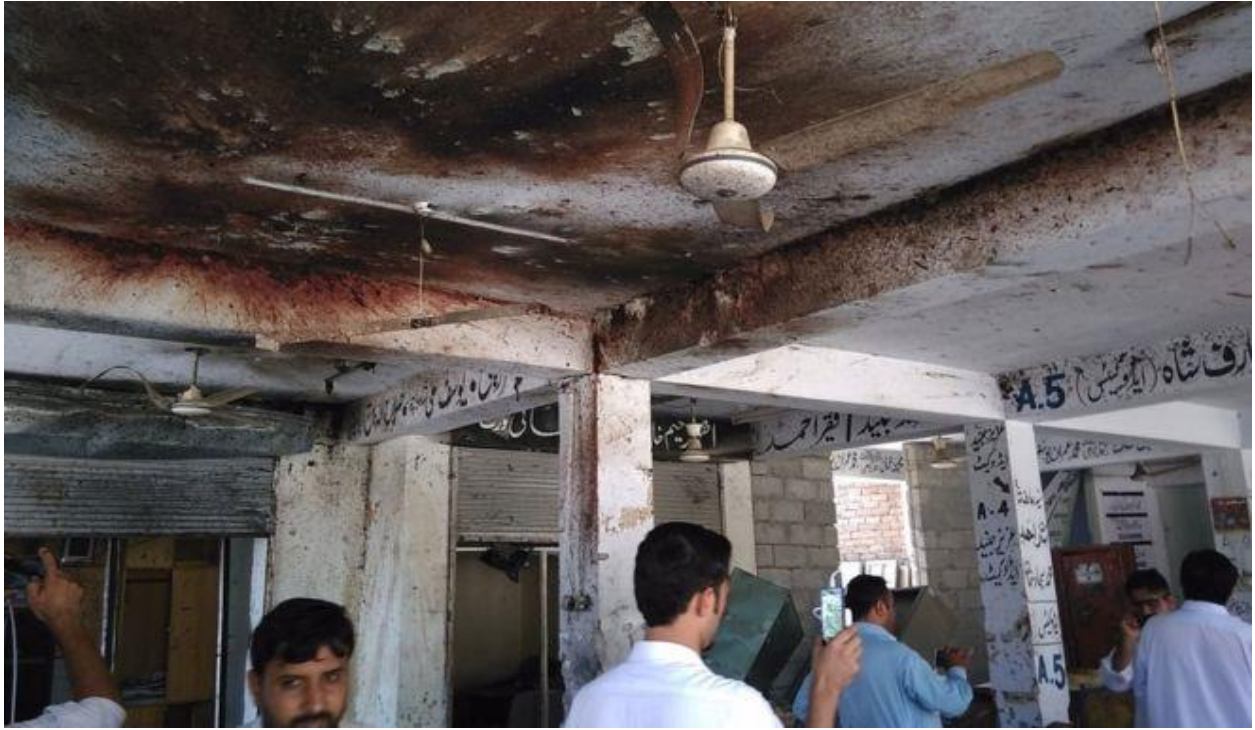
Blast Site in Mardan, BBC News, September 2, 2016.