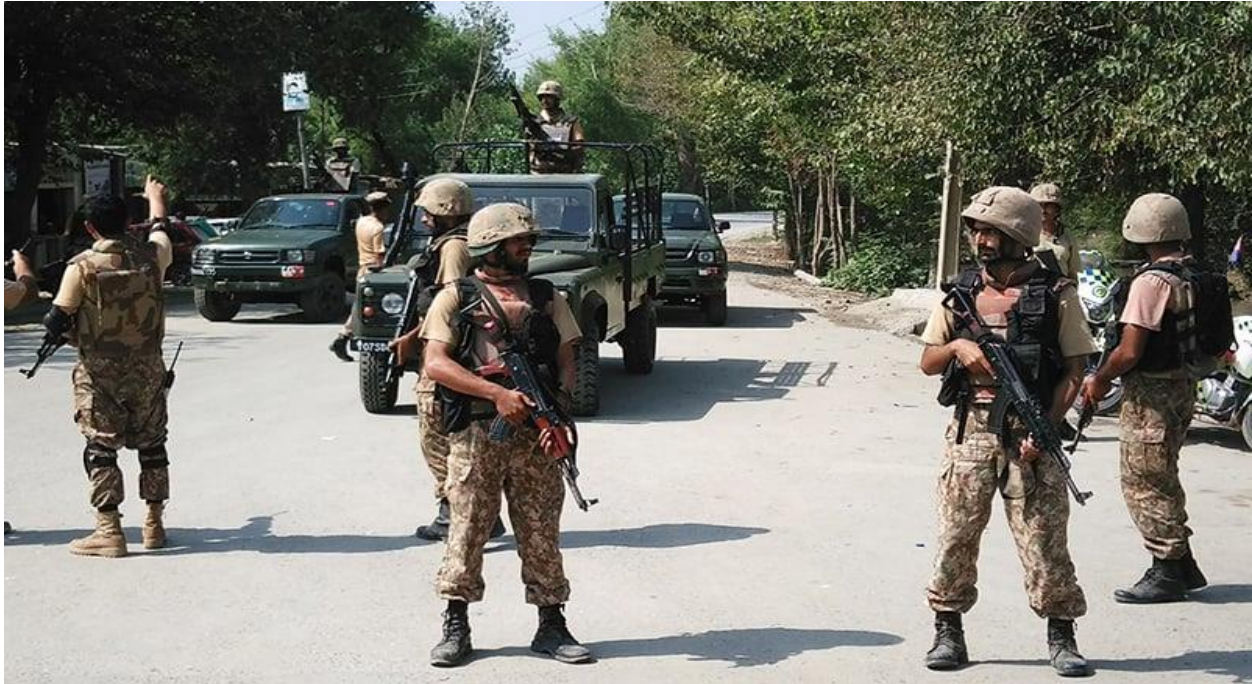
Army Men at Site of Peshawar Attack, Dawn, September 2, 2016.