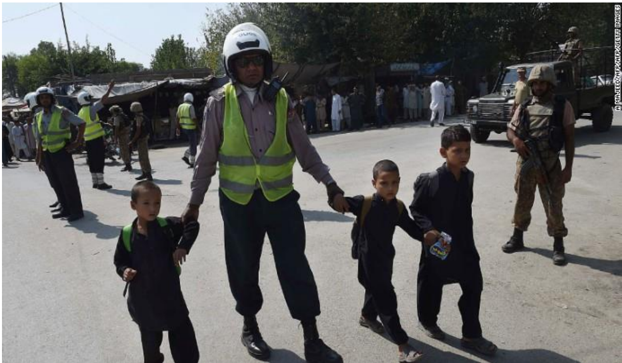
Security Personnel Cordon off the Christian Colony, CNN, September 2, 2016.