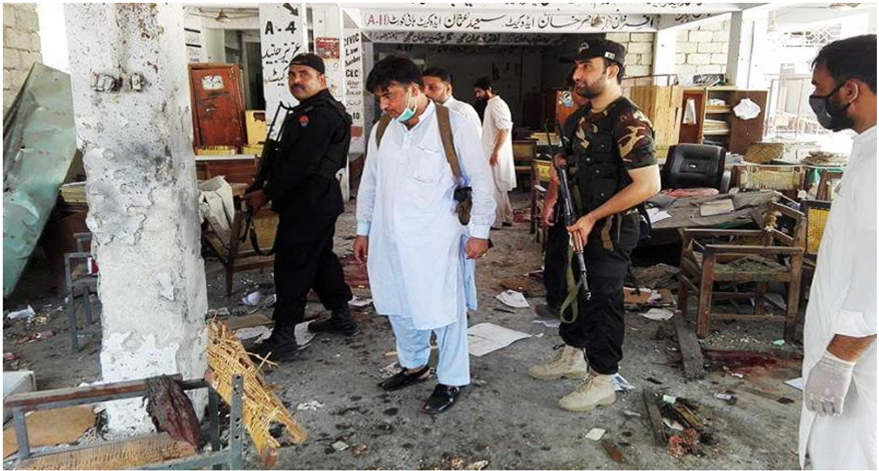
Security Personnel Investigate the Site in Mardan, Dawn, September 2, 2016.